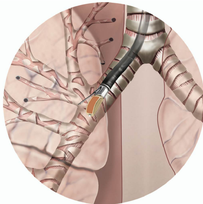
An endobronchial ultrasound

Sometimes your doctor may use a special bronchoscope that produces ultrasound images (endobronchial ultrasound - EBUS). This allows your doctor to see beyond your airways, and insert the needle more accurately. This usually takes 25 to 45 minutes, a little longer than a standard bronchoscopy. Your doctor will tell you if you need an endobronchial ultrasound.